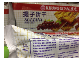
提子饼干 tízi bǐnggān sultana biscuits