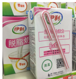
脱脂奶 tuōzhīnǎi fat-removed milk