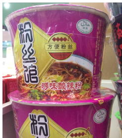
方便面 fāngbiànmian instant noodles

Here's some examples of food labelled halal: