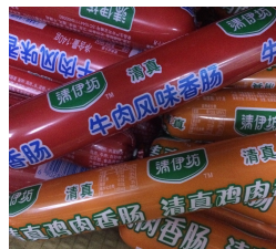
牛肉肠 níuròucháng beef sausage