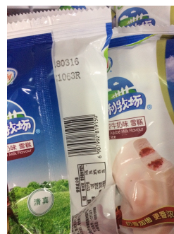
冰棍儿 bīnggùn'r icy pole 冰淇淋 bīngqílín ice cream.

If you know what to look for, you can find halal food at supermarkets.