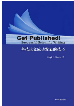
Fig.: Sections 4.