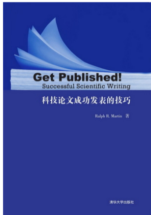
Fig.: Sections 3.6-3.10.