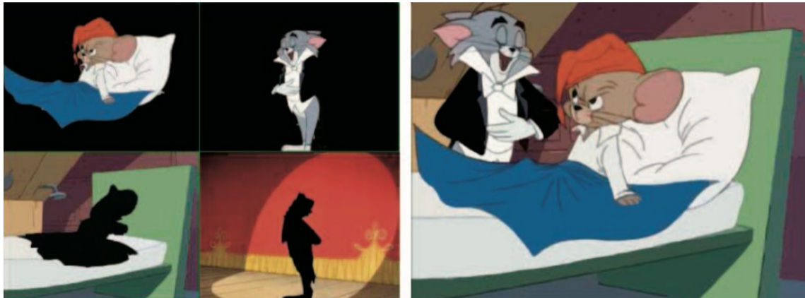
Fig.: Vectorizing Cartoon Animations, IEEE TVCG 2009.