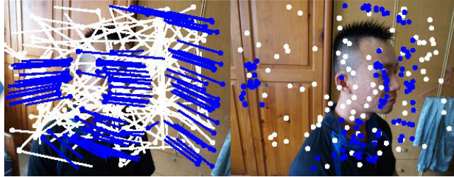
(b) Create noisy hypothesis set