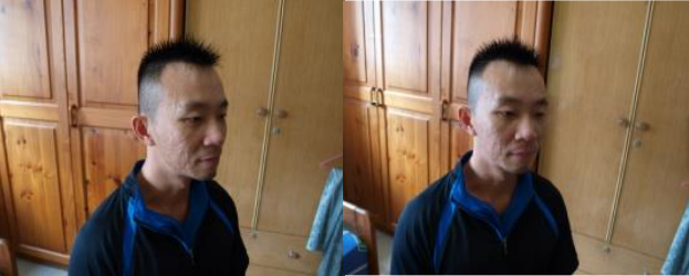
(a) Input images